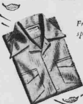
From these three ARROW sports shirts for college men

1. CORDUROY — Soft as a rabbit's ear. So nice you'll wear it to bed. An Arrow exclusive. $7.50