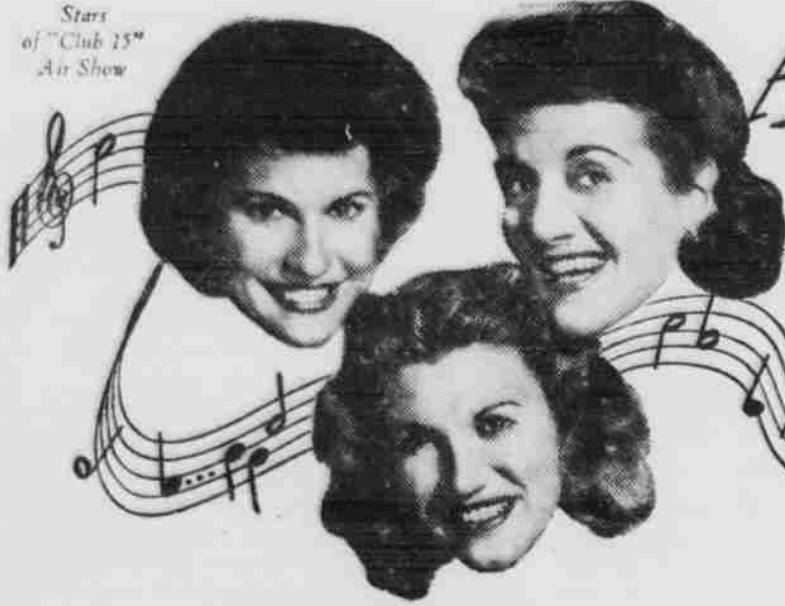
Stars of "Club 15" Air Show

ANDREWS SISTERS have a honey of a new record*