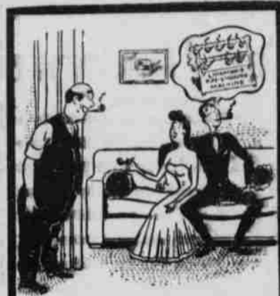
"All I said was—'A penny for your thoughts' and he reached up and gave me a Pre-Smoked Dr. Grabow pipe!"

Ski School, unlimited use of lift, lodging, and food included. Rates apply only to students staying the full seven days. For reservations write The Hotel Jerome Aspen.