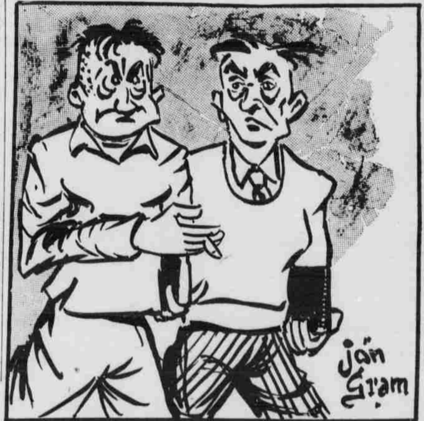
"That phone at Raymond Hall is always busy - - it's as inevitable as death, taxes, and spaghetti at the Campusline. . ."