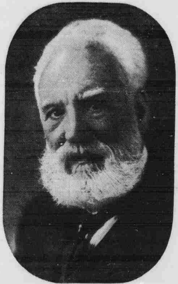
ALEXANDER GRAHAM BELL by Moffett, 1918.