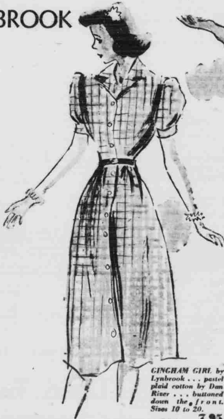
GINGHAM GIRL by Lynbrook . . . pastel plaid cotton by Dan River . . . buttoned down the front. Sizes 10 to 20.