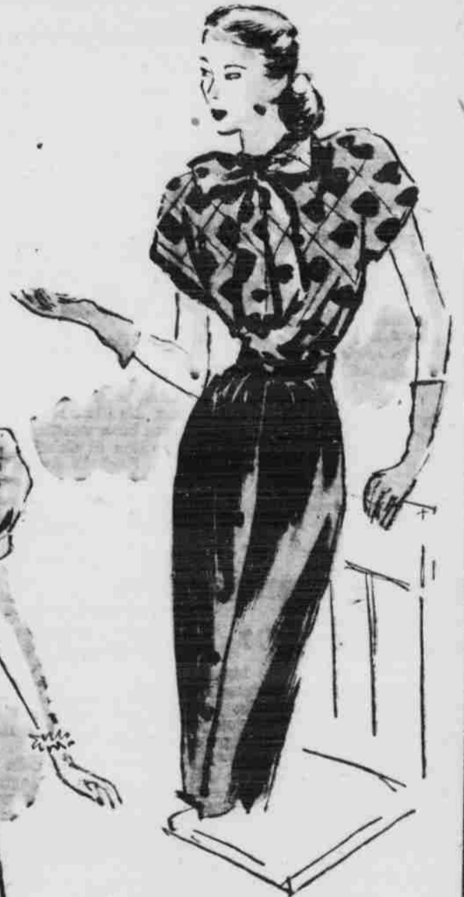
PLAID 'n PLAIN by Lynbrook . . . plaid gingham combined with black spun rayon skirt. Sizes 12 to 18.