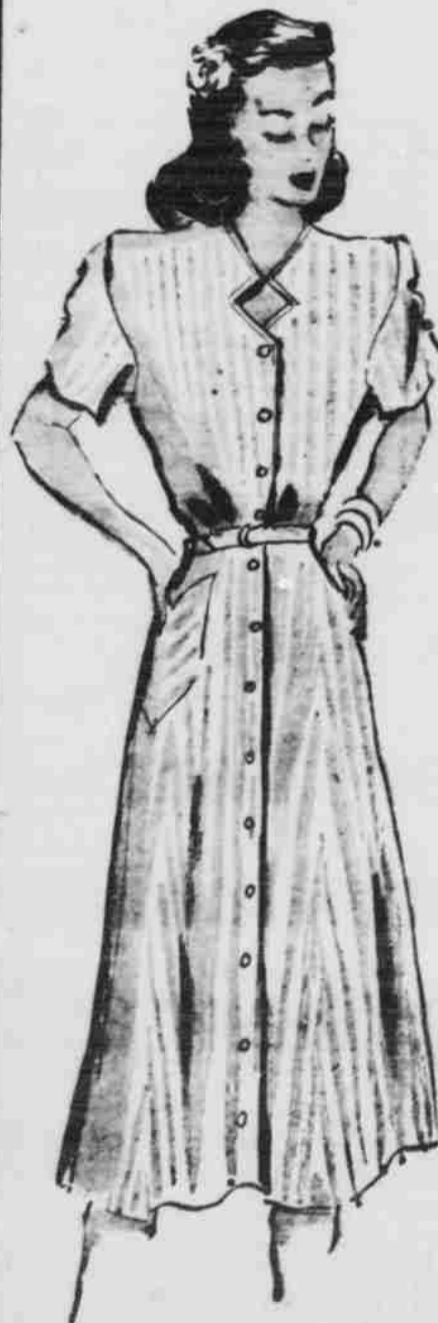
CANDY STRIPE by Lynbrook . . . a classic coat-dress in a fine Dan River cotton. Sizes 12 to 38.