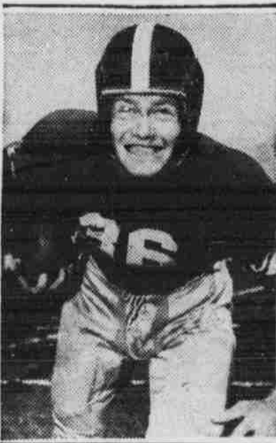
DARRELL ROYAL—Oklahoma back who intercepted two Missouri passes last week. He will be a threat to the Huskers' aerial game when the two teams meet Saturday at Norman.