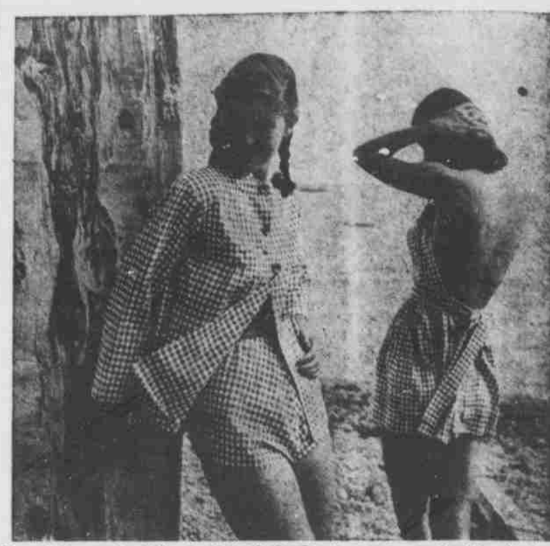
Royal blue and white checkered ginghams are a new fashion feature for the beach. At left is a yoked jacket and rounded diaper-cut shorts. At right is a beach apron to cover shorts,