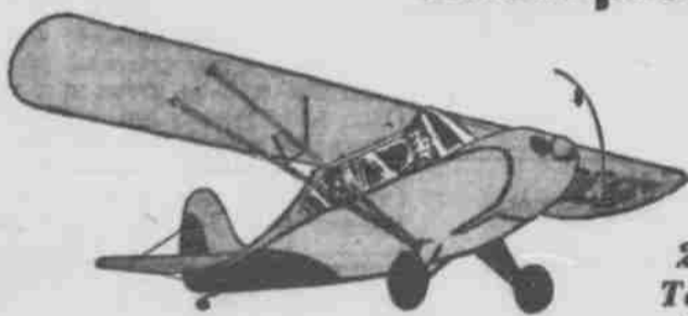
2-Seat Tandem Type

Airplane Now on Display on our Fourth Floor