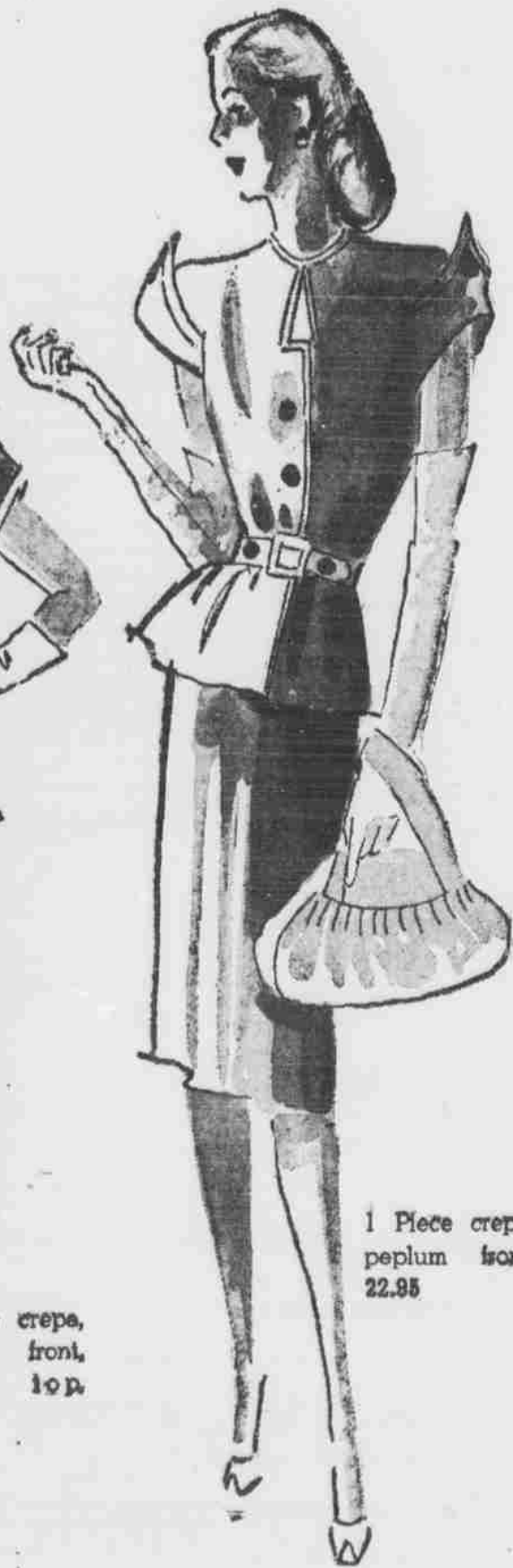
1 Piece crepe, peplum front, 22.95