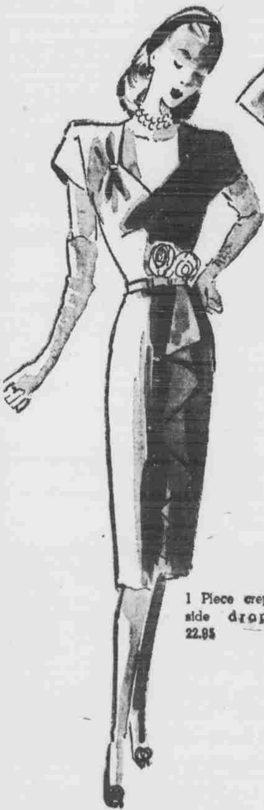
1 Piece crepe, side drape, 22.95