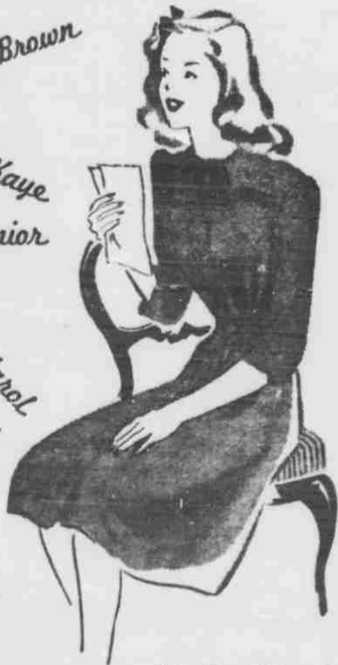
Ellen Kaye date-er in gleaming rayon-gabar-dine $16.95