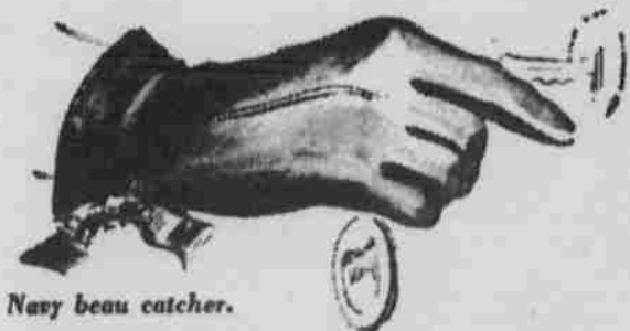
Navy beau catcher.