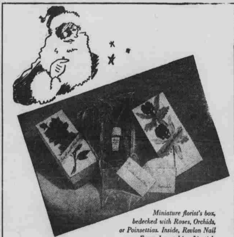
Miniature florist's box, bedecked with Roses, Orchids, or Poinsettias. Inside, Revlon Nail Enamel, matching Lipstick. $1.25

If her eyes begin to gleam, as she bids you to come in, And she twists each stalking seam and