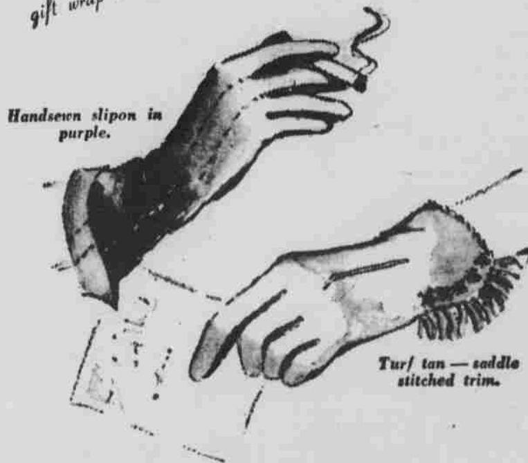
Handsewn slipon in purple.

A carnival of color—all washable dooskin and caps. yourself! Come in Thursday for your selections. We'll Here's a real Christmas gift suggestion—get some for gift wrap them for you.