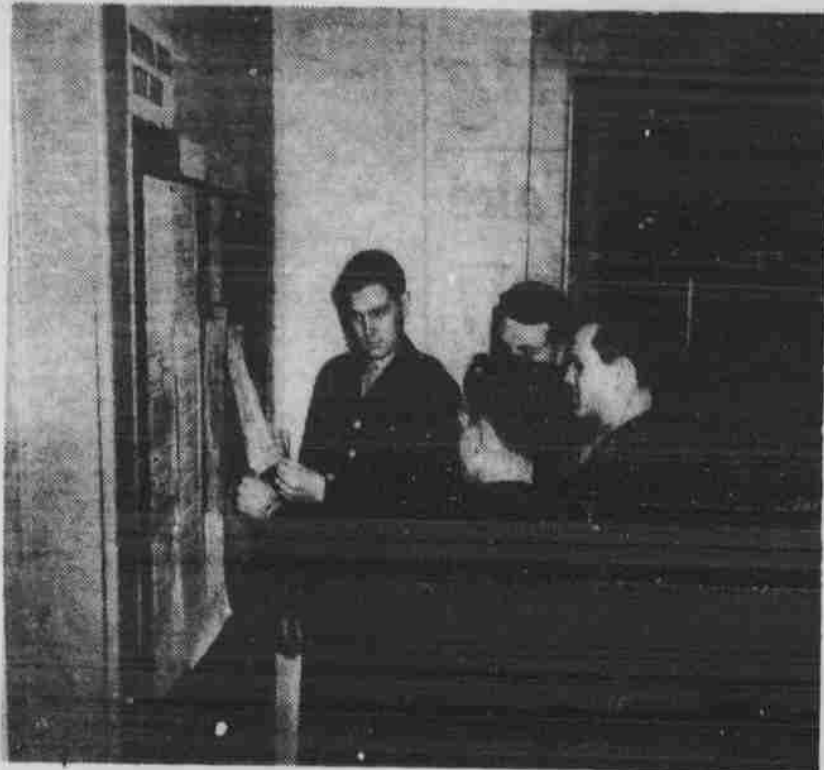
Maybe the call will come today, maybe next month, but meanwhile senior men in ROTC advanced drill keep up to date on military releases from the war department.