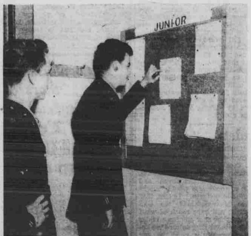
What is the official word today? Two junior men in ROTC advanced drill read the various messages from Washington, D. C. on the military department's junior men's bulletin board.