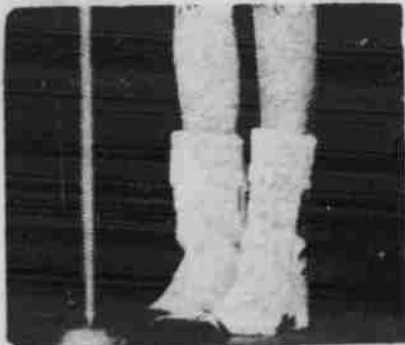
These Are Out . . .

The more conservative half of the college, or, the men, are apparently rather unconcerned with the news that has caused such a flurry among the women. The survey shows that they own a mere three and a half pair of shoes, and feel quite extravagant if they purchase two pairs a year. Their indifferent attitude toward the rationing is probably due to the idea in the back of their minds that they will be sporting government issue footwear in the "near future."