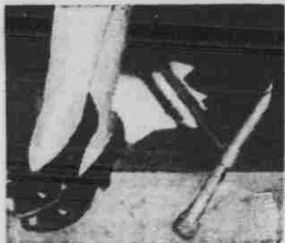
Look for This . . .