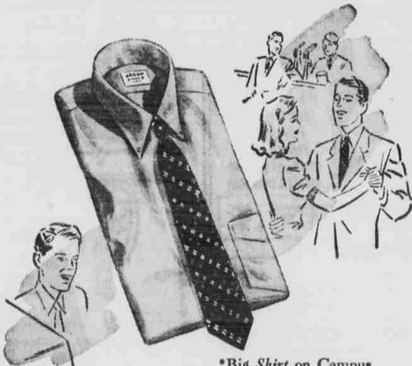
*Big Shirt on Campus

ALWAYS in a top spot in campus popularity polls is Arrow's Gordon Oxford shirt—with regular and button-down collars. Gordon fits you perfectly, because it is cut on the Mitoga form-fit pattern. What's more, it can't shrink more than a microscopic 1%, for it bears the Sanforized label. All for just a slight fee — $2.50.