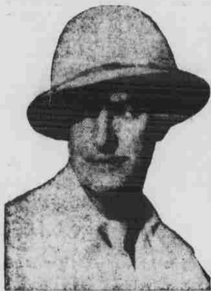
Carveth Wells ... speaks to teachers.

Panel discussions and special meetings are scheduled for this afternoon, followed by the closing general session of the convention this evening. The program of the