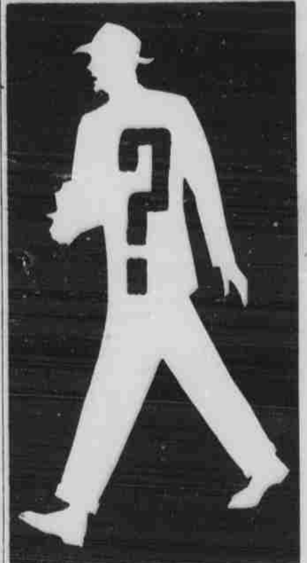
Esquire, Inc. 1942 BDOC ... to be revealed tonight

(And if they give me a by line on this, I'll have to leave town with the rest of the Innocents.)