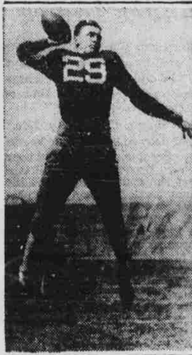
...in football and basketball alike, he holds records.