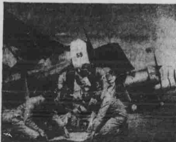
You fly these sleek Meyers Trainers in Secondary Training, specially designed for aerial acrobatics.

SECONDARY STAGE, open to graduates of Primary Stage holding Private Pilot CPT Certificates provides 40 to 45 hours training on sleek new Meyers Trainers, including aerial acrobatics and advanced maneuvers. Up to 6 hours credit given. Course fee, including insurance and physical examination, only $34.