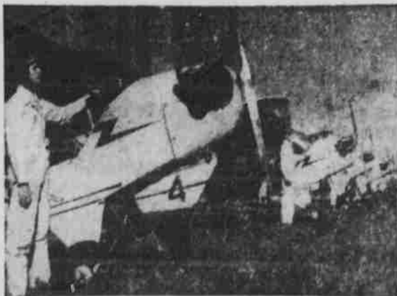
You receive Primary Training on these "easy-to-fly" Piper Cubs.

YOU MEN OF THE UNIVERSITY HAVE AN UNPARALLELED OPPORTUNITY RIGHT NOW TO RECEIVE PRACTICALLY WITHOUT COST, GOVERNMENT APPROVED FLIGHT TRAINING VALUED UP TO $3500. CPTP FOUR-STAGE PROGRAM QUALIFIES GRADUATES FOR HIGH-PAY POSITIONS AS FLIGHT INSTRUCTORS AND AIRLINE CO-PILOTS.