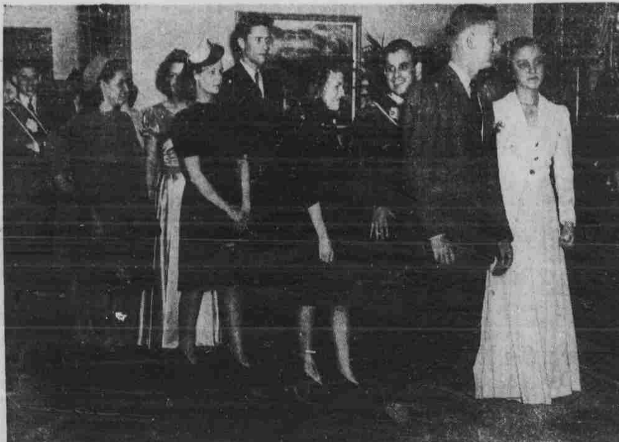
Some of the 1,500 freshmen present at the Chancellor's reception Friday night are shown above being led down the receiving line.

charge of the dining room where refreshments were served. Each of the two serving tables was decorated with a large red N with red and white flowers at the base.