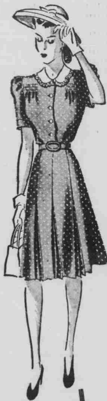
Smart shoulders will be seen this season in Ann Foster's Seersuckers, Tropical Broadcloths, Bemberg's Irelia Sheers and Chambrays. $3.95 to $7.98