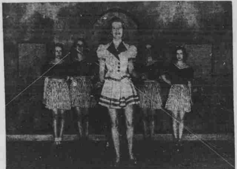
—Sunday Journal and Star

With wigs in the trash can and burlesque and horseplay history, (See SHOW, page 2.)