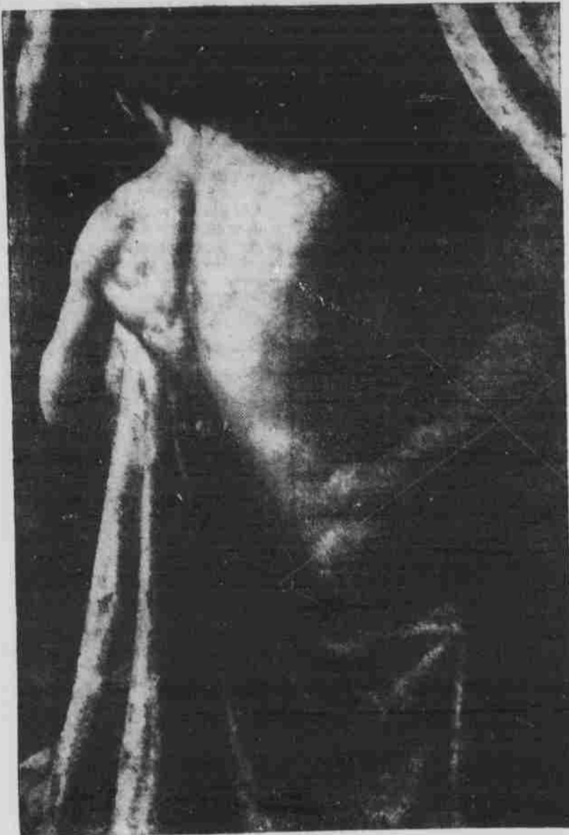
Journal and Star.