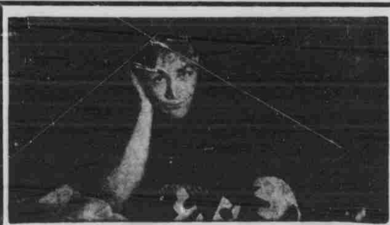
BUS. MGR.'S DILEMMA!

Only 4 More Days To Have Your '41 Cornhusker Picture Taken