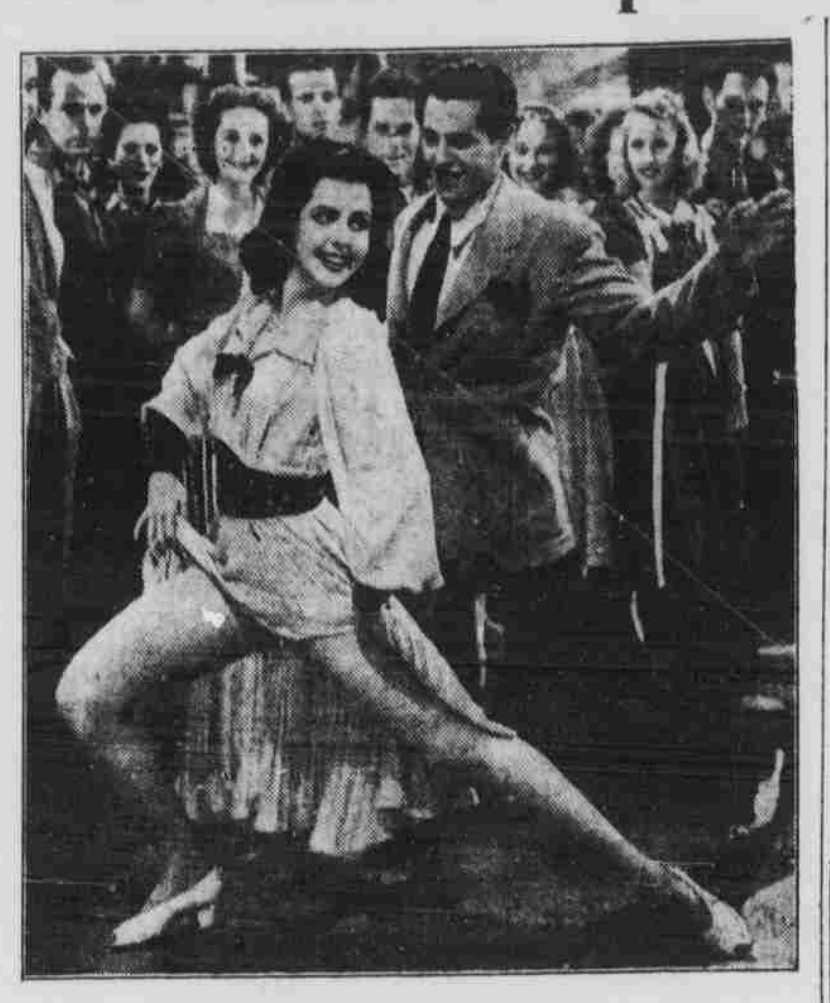
TOO MANY GIRLS