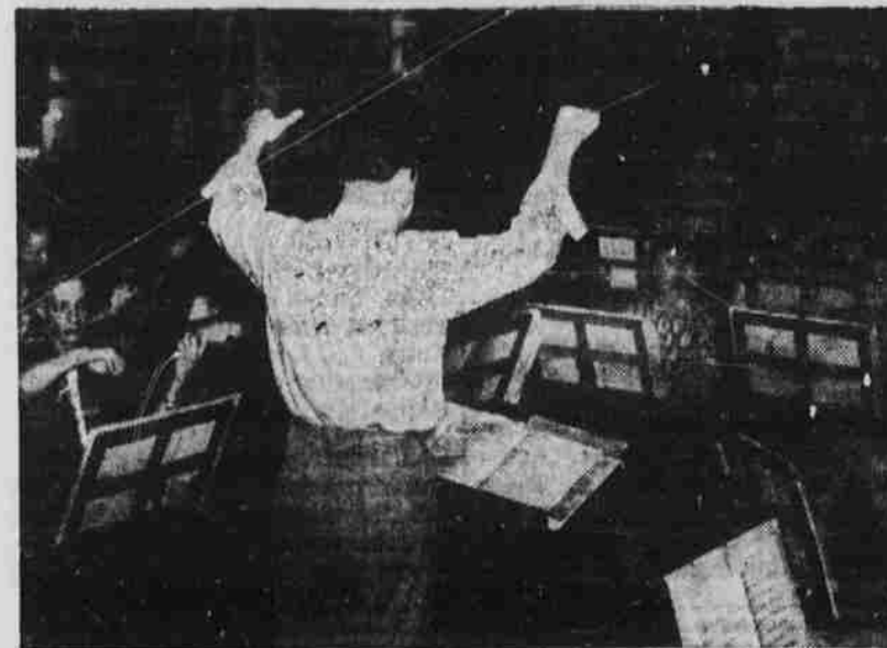
Singing and playing for dear life and the fun of it, the All-State high school orchestra and chorus practice for their final performance Tuesday night.