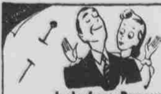
Lady from Barrow

TYPEWRITERS for SALE and RENT Nebraska Typewriter Co. 130 No. 13th St. LINCOLN, NEBR. 2-3157