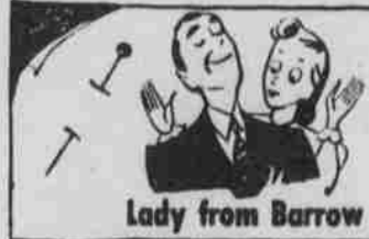
Lady from Barrow