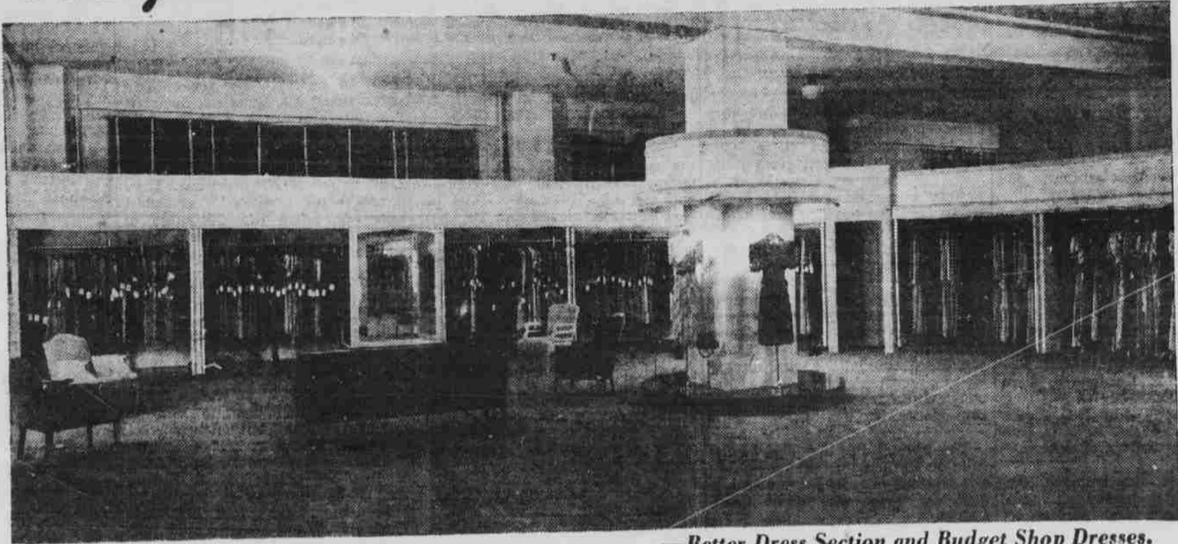
—Better Dress Section and Budget Shop Dresses.