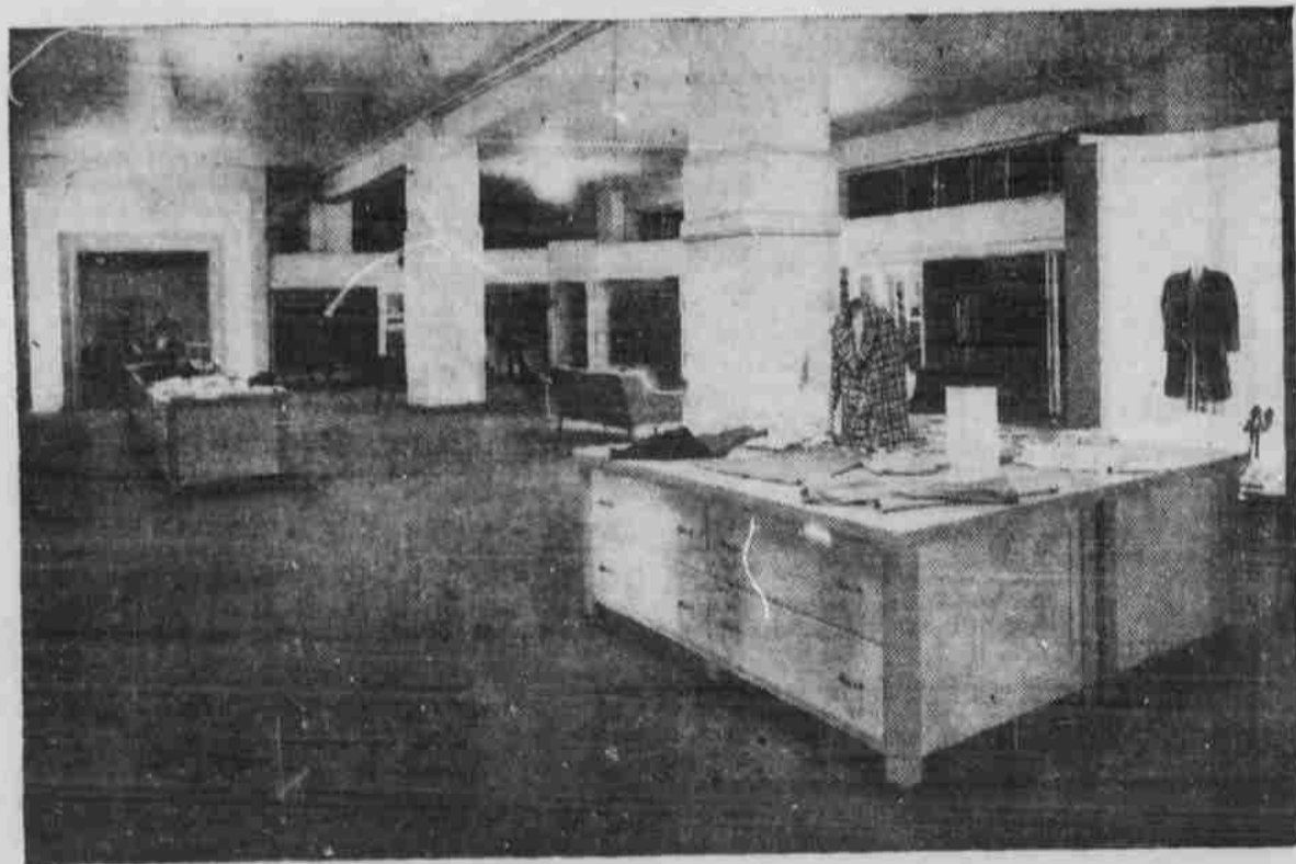
—Furs, Coat and Suit Section