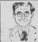
1 The Door-Knob Knot