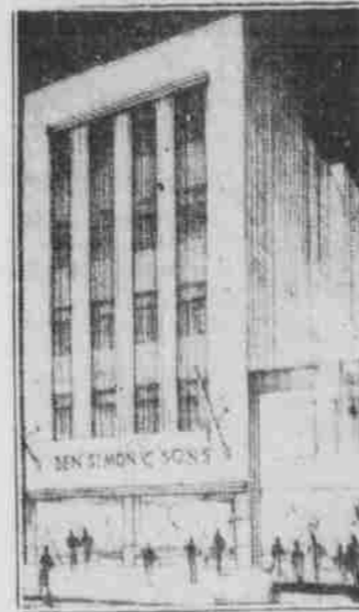
The new home of Ben Simon & Sons growing higher every day.

Good Luck Nebraska U ORPHEUM GRILL 223 No. 12th