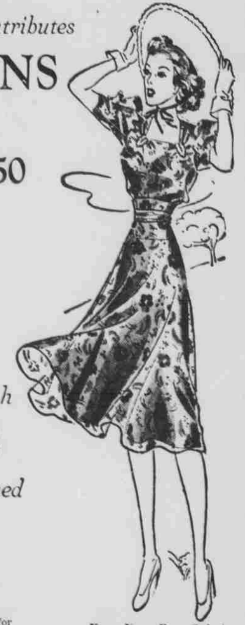
Keep Your Furs Safe in Rudge's Refrigerated Storage