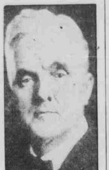
SENATOR GEORGE W. NORRIS, ... influenced Washington circles.