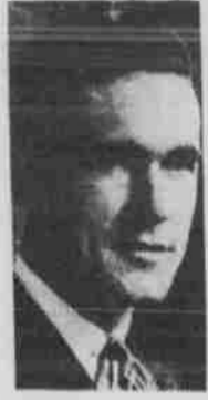
By Bruce Campbell