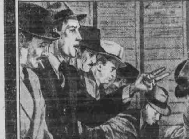
5. INDEPENDENT Buyers, Auctioneers and Warehousemen. Sworn records show that, among these experts, Lucky Strike has twice as many exclusive smokers as have all other cigarettes put together. A good thing to remember next time you buy cigarettes.