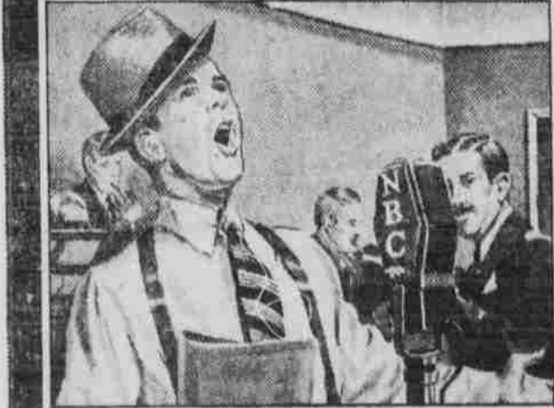
2. "REHEARSING FOR 'Your Hollywood Parade', my new radio program. Luckies are the gentlest cigarette on my throat." (Because the "Toasting" process takes out certain irritants found in all tobacco.)