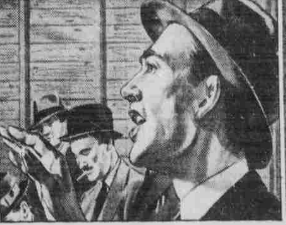
4. "SOLD AMERICAN", the auctioneer chants, as the choice center-leaf tobacco goes to Lucky Strike. Men who earn their living from tobacco, know that Lucky Strike buys the finest grades. These men are the ...