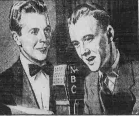
3. "THAT AUCTIONEER on our program reminds me that, among tobacco experts, Luckies have a 2 to 1 lead over all other brands. I think Luckies have a 2 to 1 lead also among the actors and actresses here in Hollywood."