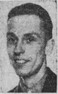
by ED STEEVES