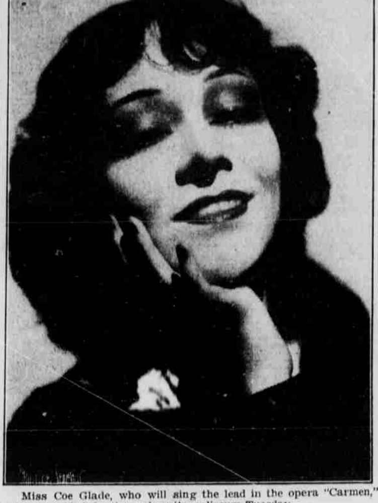
to be presented in the university coliseum Tuesday.