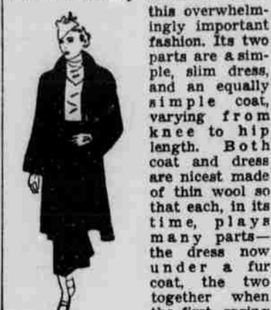
breezes blow, the coat over printed crepe or bright crepe dresses still later.

March—spring breezes, fresh young buds—and also costume suits. They're youthful, different, charming—this new type of suit that is a strictly urban version of