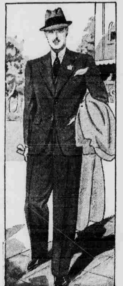
Single Breasted . . .

Many eastern colleges are showing a decided preference this spring for the single breasted models. At Nebraska (here we go predicting) it will run a close race for popularity with the double breasted. Again, the fabrics and colors are sportier than usually.