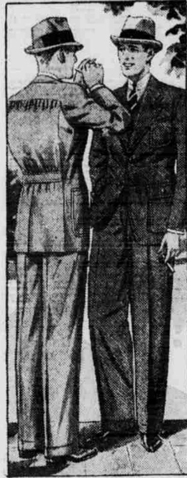
Shirred Back . . .

This advertisement is an answer to the question which college men ask us every day: "What's new?" And, if after reading this you are still in a haze about the very latest in men's clothing, then come in and visit with us. We really do take pride in being so smart . . . in knowing how to dress you correctly rectly . . . yet inexpensively!