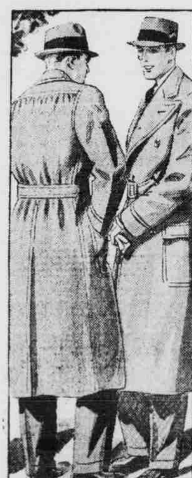
Topcoat Fashions . . .

Polo styles! Shirred backs! Wrap-arounds! All three are equally good. You'll find the polo and shirred back coats in either half or full belted, while the wrap-around requires a full belt. Small checks in greys and tans are especially good. In addition to the plain greys and tans.