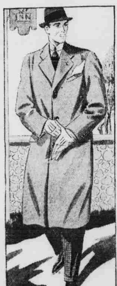
The Plain Topcoat . . .

Again we find our old friend, the plain topcoat! Its popularity and correctness has made it a favorite for several seasons. And from the outlook now, it'll hold its own again this spring. Too, its continued appearance in the fashion picture makes it a very safe buy!