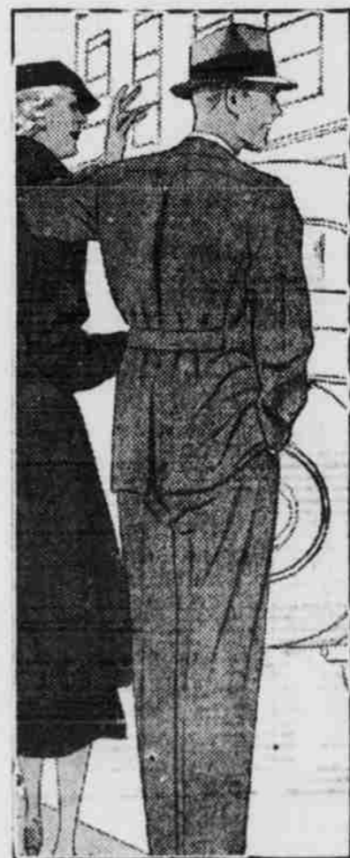
Sports Back . . .

This style evolved from the popular free-swing suit of last summer and early spring. It has the same sporty appearance that the shirred back presents, though the pleats are much deeper. It likewise is half-belted, with patch pockets, and slit coat.