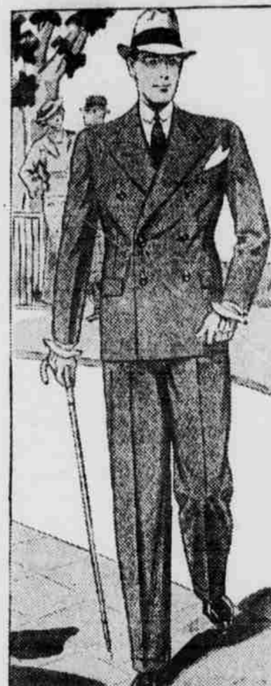
Double Breasted . . .

The conservative double breasted suit is still in the front ranks of fashion. It is particularly good for the occasion which requires a bit more formality in attire, though you do see the sport tendency apparent in the colors and fabrics.