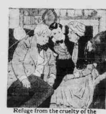
world in the arms of crusty. warm-hearted Aunt Betsey

Glorious romance reaches your heart in one of the great achievements of the motion picture... A magnificent pageant of humanity, Charles Dickens' finest love-story sweeps across the screen now as a rare and thrilling experience in the theatre.