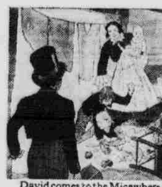
-home indeed to a homeless little boy!