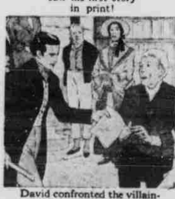
ous Uriah Heep with the ev