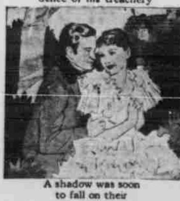
to fall on their