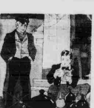
in the slums of London