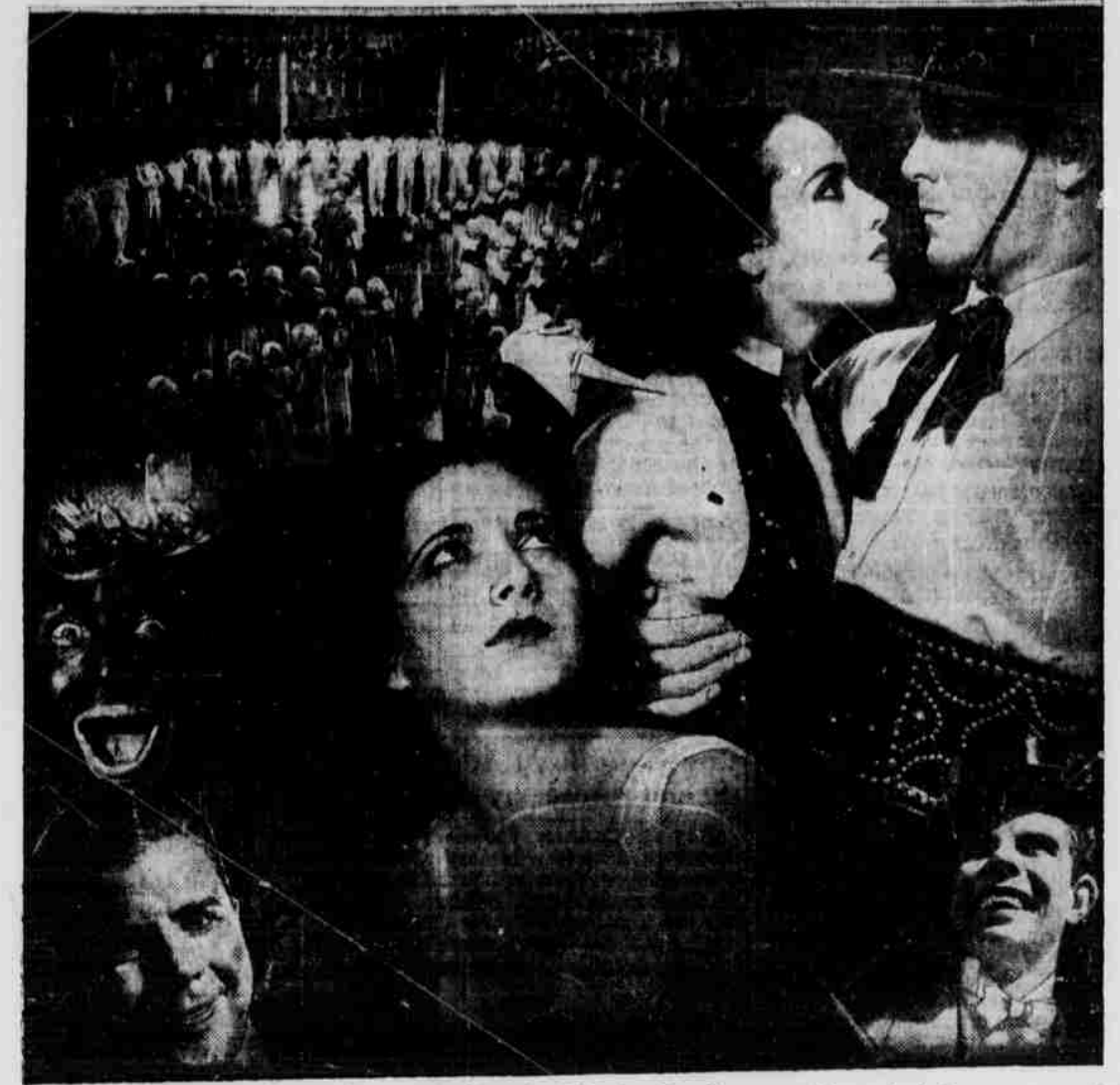
Highlighting this week's movie presentations is "Wonder Bar," mammoth musical drama, appearing the Stuart theatre, featuring an all star cast and 300 Busby Berkeley dancers.