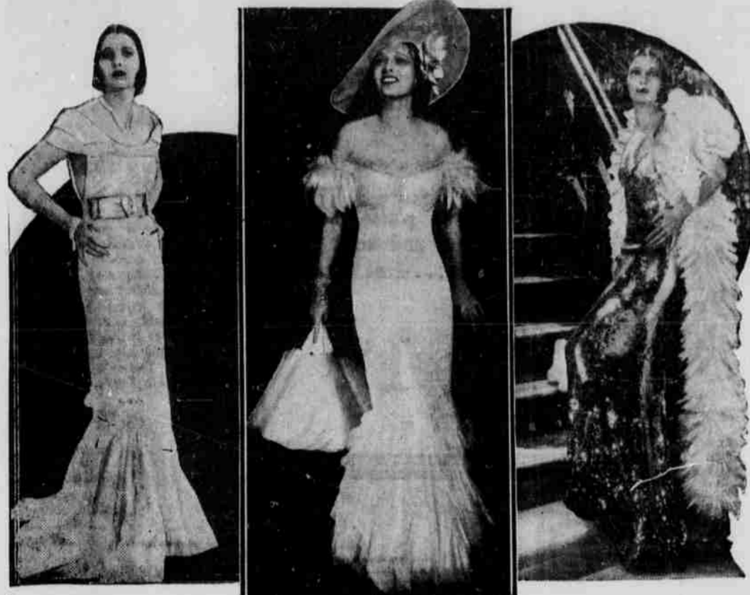
And Kay Francis shows a few of the Orry-Kelly creations from the film "Mandalay" showing this week at the Lincoln theater. On the left is a distinguished gold and white taffeta gown, with daring sleeve decoletage and shirring at the neckline. The center picture, an afternoon gown of pale pink eyelet embroidery in tunic lines over a petaled skirt of organza. At the right, shimmering silver sequins.