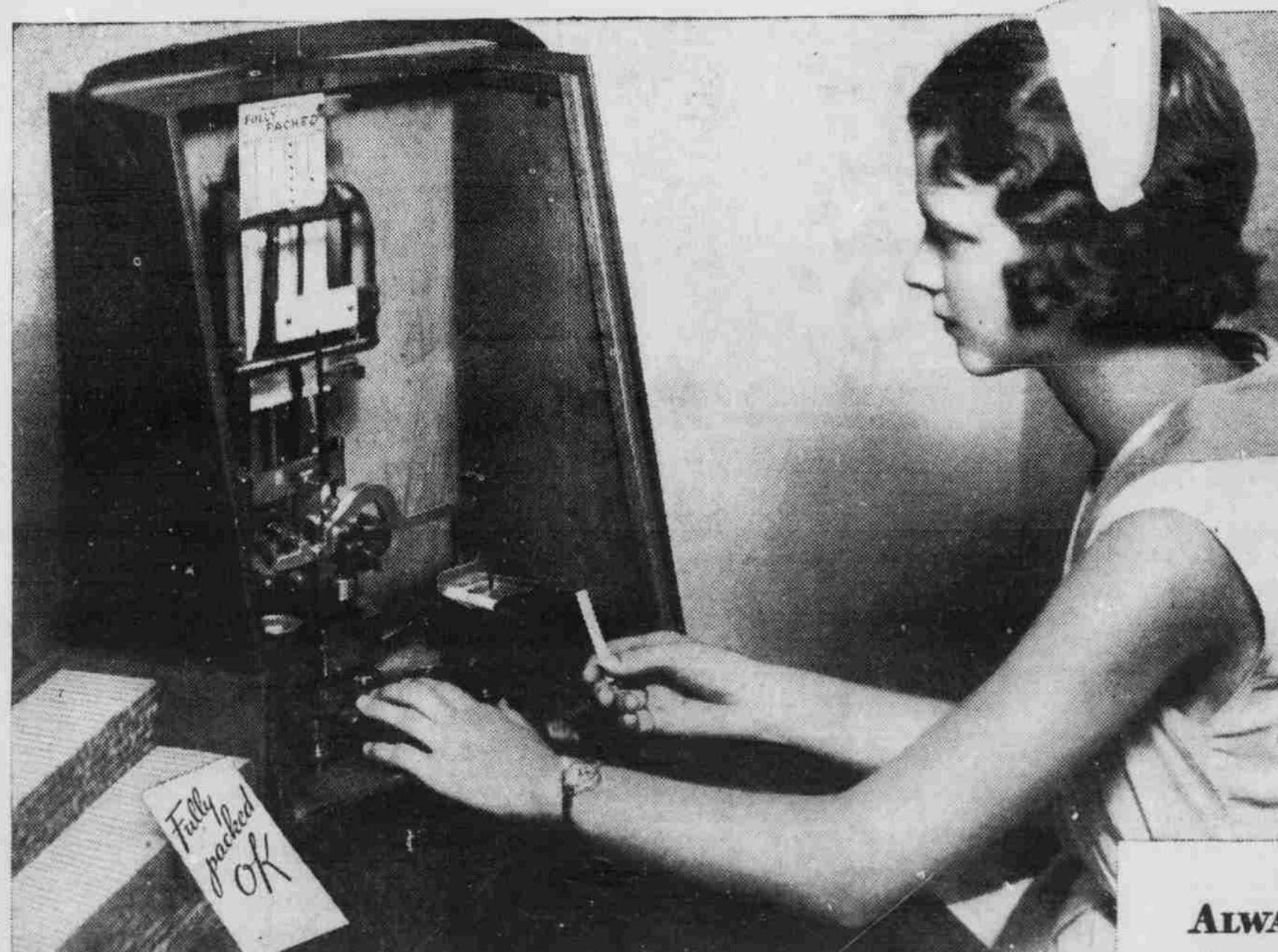
"it's toasted " FOR THROAT PROTECTION-FOR BETTER TASTE

Choice tobaccosand no loose ends -make Luckies burn smoothly