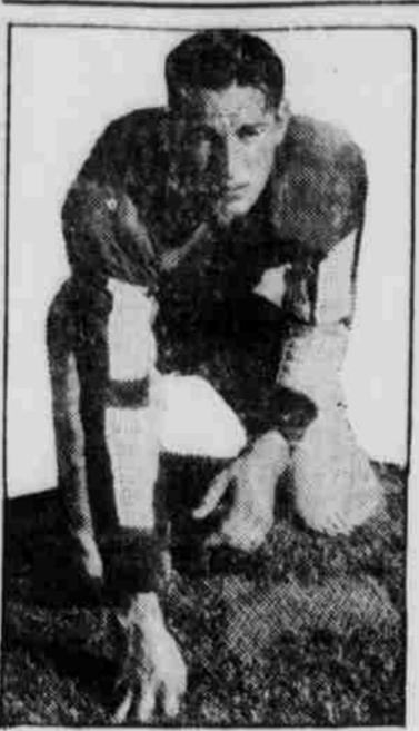
RUNDELL - END