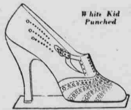
White Kid Punched