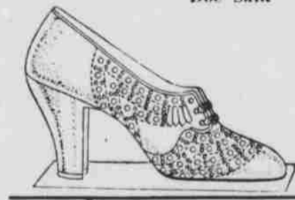
White Punched Doe Skin

Pumps-Straps- Sport Oxfords -All Sizes-All Widths.