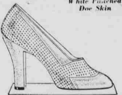
White Punched Doe Skin