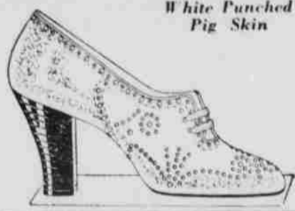
White Punched Pig Skin