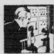
An alarm! Headquarters radios it to cruising cars.

Police Radio is "joining the force" in many a city—acting as a breakwater in checking the surge of criminal activity... The apparatus the police are using comes out of the telephone workshop. It is logical that