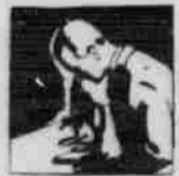
This engineer's "precinct" is a laboratory.

Western Electric should make the equipment, drawing on a fifty-year experience as manufacturer of telephones for the Bell System... Serving this vast organization is a huge responsibility. Carrying it out means