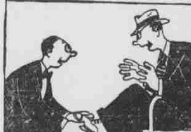
Then you try them on-and you feel like purring -they're so comfortable.