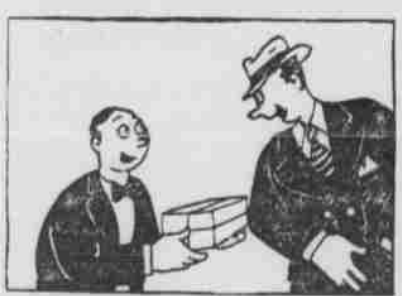
And mister-when you're told the price-! Say that's a SURE ENOUGH happy moment!

There are all kinds of moments in a fellow's life—some good and others not so good. The reason we enjoy selling Florsheim Shoes is that they deliver so many happy moments to the men who wear them!