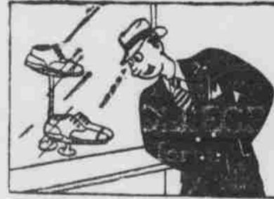
You spot a pair of Florsheim Shoes with just the snappy note of style you admire.