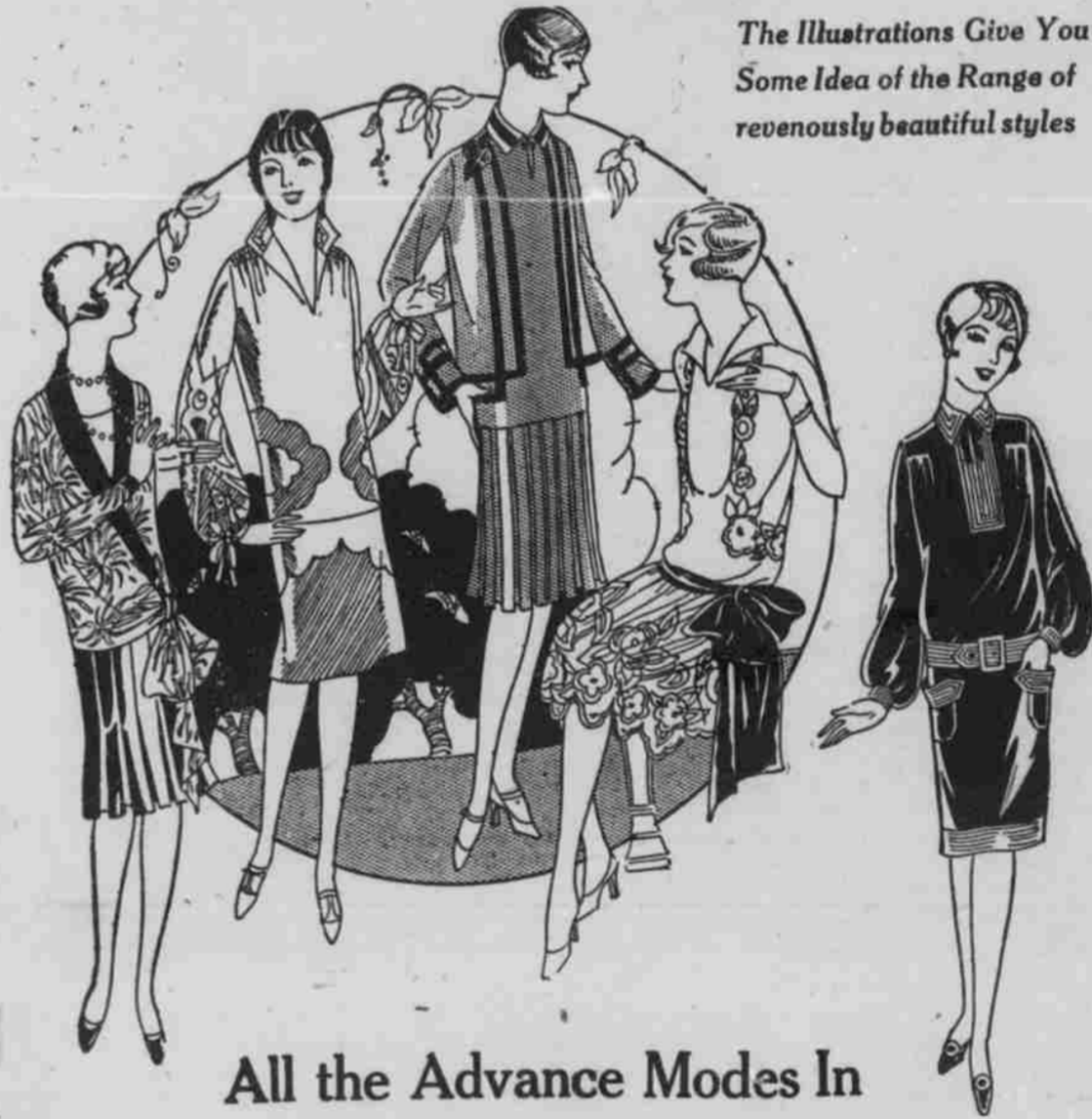
The Illustrations Give You Some Idea of the Range of reverently beautiful styles

All the Advance Modes In New Spring Dresses Included In An Amazing Feature Group At $17.50