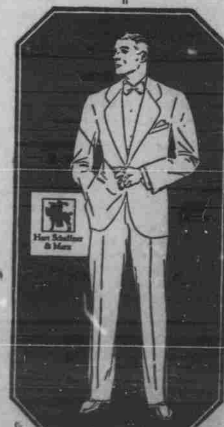
We Dress The College Man For Night