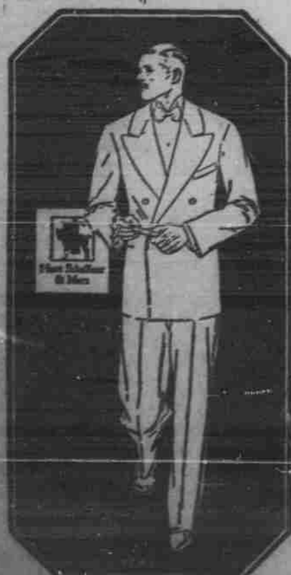
We Tug The College Man For Day