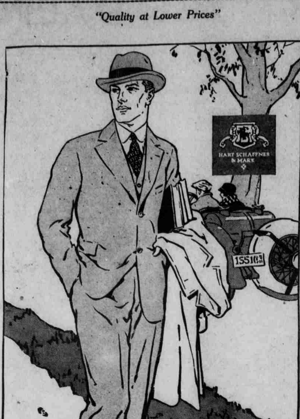
© 1925 Hart Schaffner & Marx

Members of the Varsity baseball squad are expected to be ready for practice at 3:00 daily at the Armory. Freshman practice will be announced later.